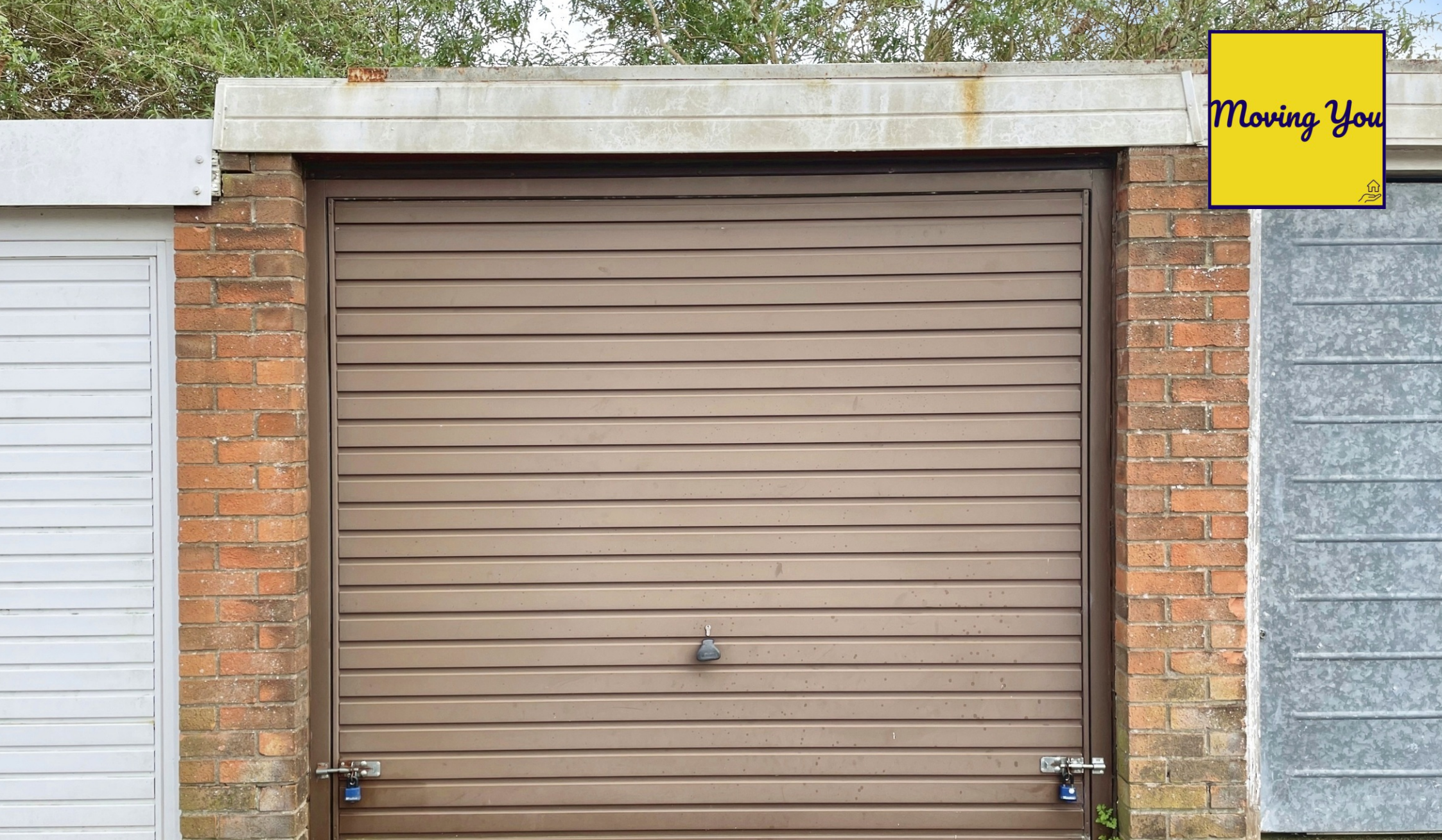
Garage lying to the west side of Soundwell Road